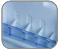
Adjustable door shelves

The Onity hospitality solutions range incorporates a series of user-friendly and silent minibars.