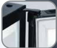
Reversible reinforced door hinges