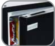
Integrated door opening holder