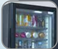
Glass door (optional)